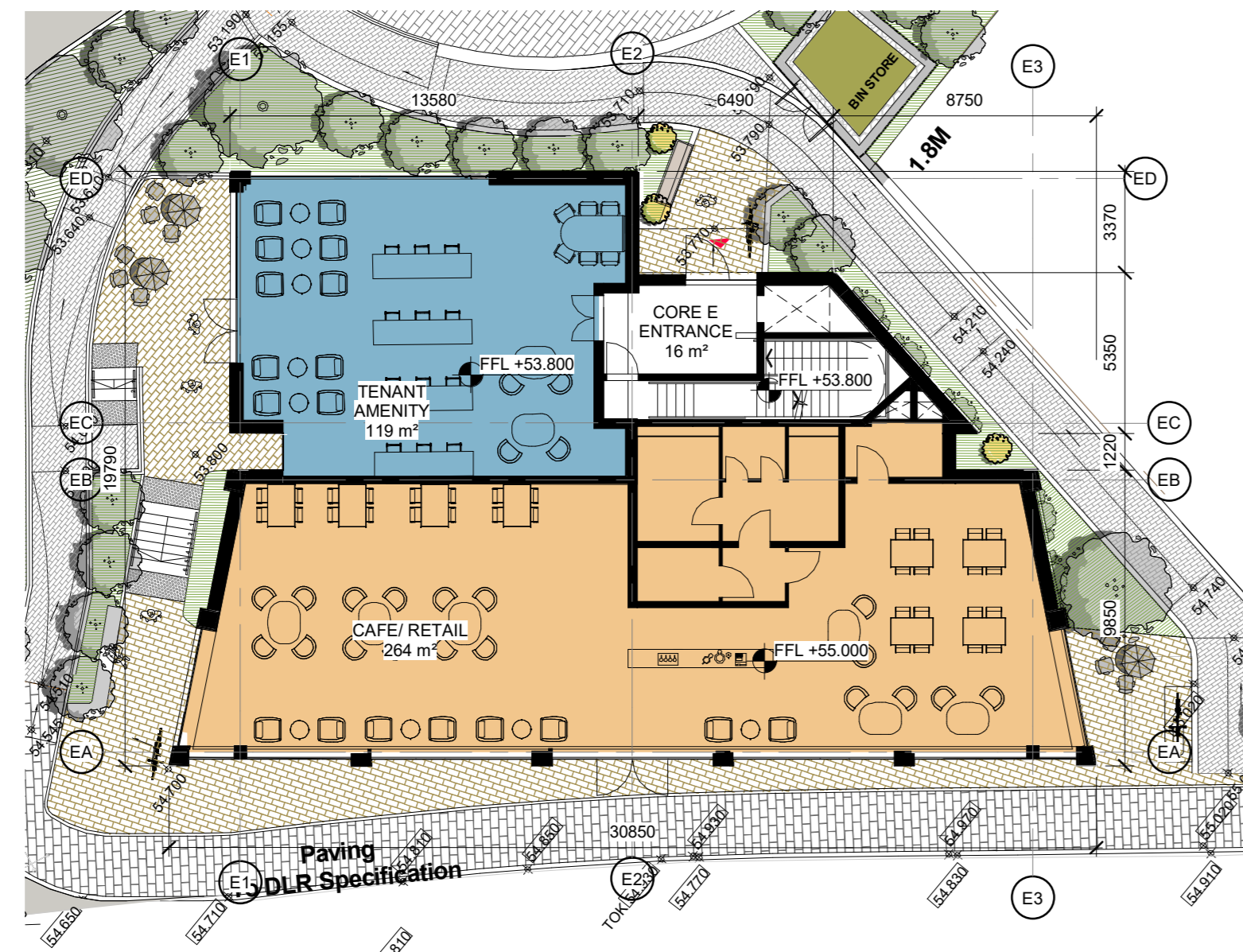
1 Building E -Ground Floor Plan 1 : 200