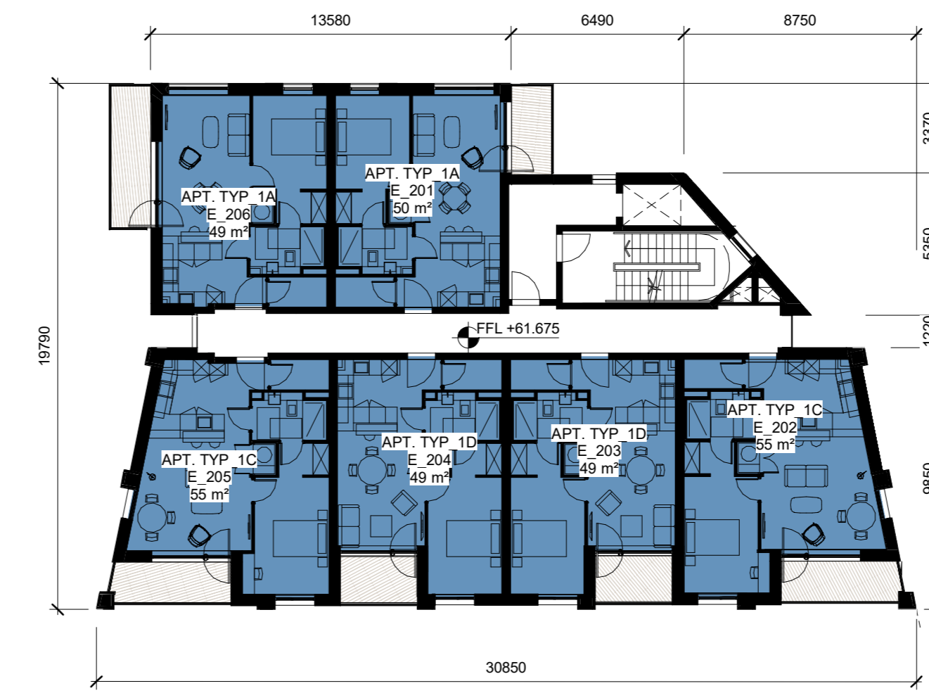
3 Building E - Second Floor Plan 1 : 200