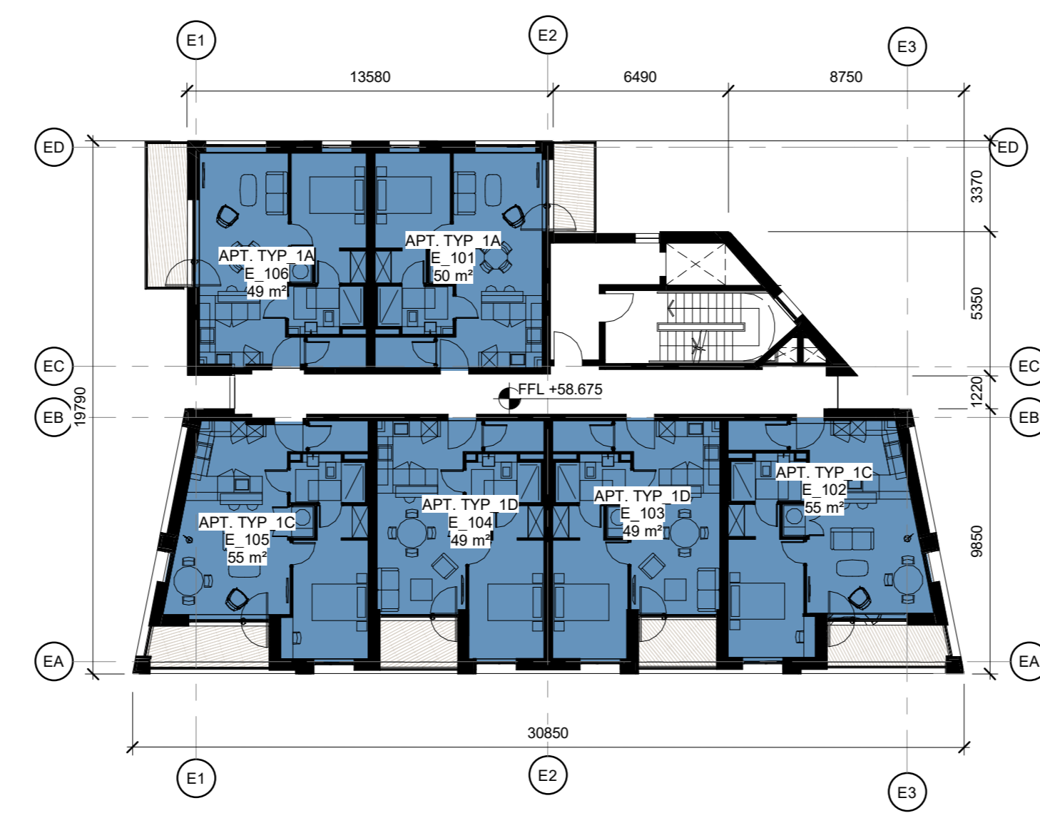
2 Building E -First Floor Plan 1 : 200